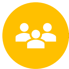
Unmet Needs Analysis