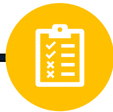
Mitigation Needs Assessment